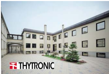
Figure 4: THYTRONIC Headquarters

THYTRONIC is a provider of products and services for protection, monitoring, and control of electric power systems. THYTRONIC'S mission is Ensuring Safe and Secure Power Distribution . THYTRONIC currently provides a range of single and multifunctional digital protective relays for power distribution (feeder and bus-bar protection, motor protection, and transformer protection) and power generation (generator protection and synchronizing devices).