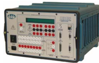
Figure 1: F6150 Power System Simulator

Doble Engineering has been serving the electric power industry by providing diagnostic instruments, services and knowledge for 85 years. Doble provides diagnostic test instruments and technical support services for transformers, circuit breakers, and relay protection systems. Doble Engineering also provides the on-line diagnostic systems for transformers and gas insulated apparatus. Doble has close working relationships with energy generation and delivery companies, as well as industrial power users, working in partnership to improve the performance of their systems and operations.