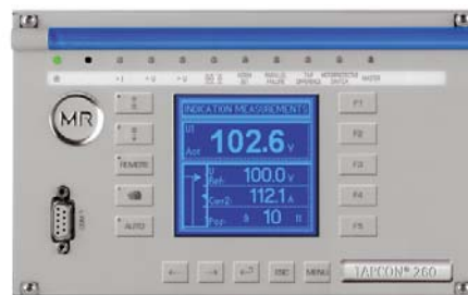
Figure 3: TAPCON 260 Tap Changer

MR began their IEC 61850 product development in early 2004 with the purchase of SISCO's MMS-EASE Lite source code for the IED and the AX-S4 MMS client software for testing. After obtaining product training from AMA-Systems in Germany, MR was ready for factory tests of the first IEC 61850 systems by the summer of 2004. MR found that the implementation of IEC 61850 within their TAPCON product was no more difficult than the typical serial link protocols that had been used in the past. With the standardized logical nodes of IEC 61850 to provide a precise definition of the Automatic Tap Changer Control (ATCC), MR was able to deliver a more standardized controller that enabled easier integration with the other participants during the initial testing. Furthermore, the greatly enhanced speed of IEC 61850 running over Ethernet running at 100 megabits per second (even up to 10 gigabits/second on fiber optic cables) versus the typical 19.2 kilobits/second offered by a serial link protocol, significantly enhanced control performance.