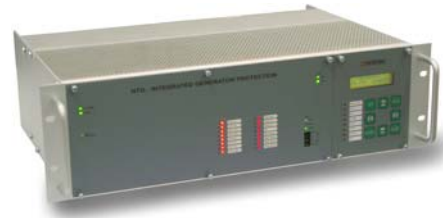
Figure 5: THYTRONIC NTG Relay

The initial steps involved investigation and analysis of the IEC 61850 standard and its capabilities by the THYTRONIC R&D department. This involved both intensive study and training seminars from multiple sources. With the fundamental knowledge of IEC 61850, THYTRONIC then acquired the MMS-EASE Lite software and began the implementation of IEC 61850 for the generator multifunction protection relay (NTG).